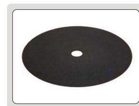
cutting blade MLP-50Z2 (included)